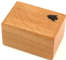
Box With a Tree Hiroshi Iwahara