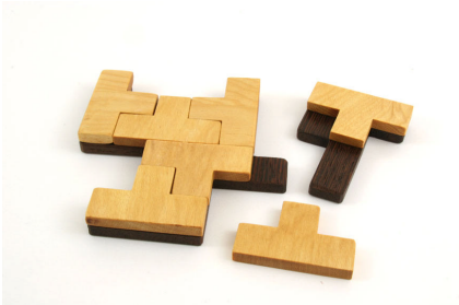
Cover It Up Robert Reid